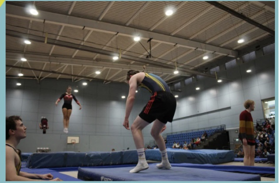
Good mat woo :)

More Coaches - I would like to promote coaching courses throughout the year again and always keep my eyes open for any budding coaches in the freshers or newer tramps. I think matting is something that I could also work on, skill!! and everyone at trainings should be able to mat safely given a bit of practice. I could run a matting workshop or just teach people to mat at trainings. ✓ We can't have too many good matters!